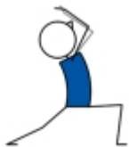
Warrior Eagle II