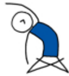
Easy Side Bend